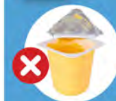
No packaging of any kind

ONLY food waste and caddy liners must go in the caddies. If you include other things, we may not be able to empty it.