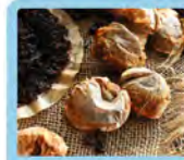
Coffee grounds and tea bags