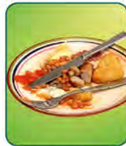
We'll also be collecting your food waste separately