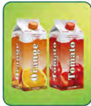
Drinks cartons such as Tetra Pak