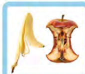
Veg and fruit peelings and cores