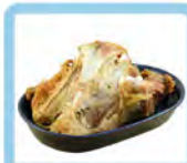
Meat, fish & bones; cooked or uncooked