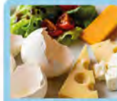
Egg shells, cheese and salad