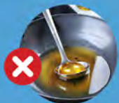
No oils and liquid fats