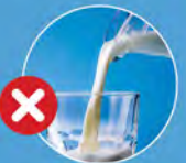
No milk and other liquids