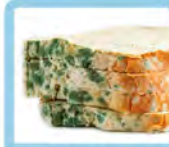
Out of date / mouldy food