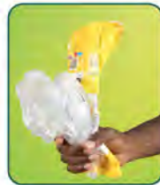
Plastic bags, wrappings and films